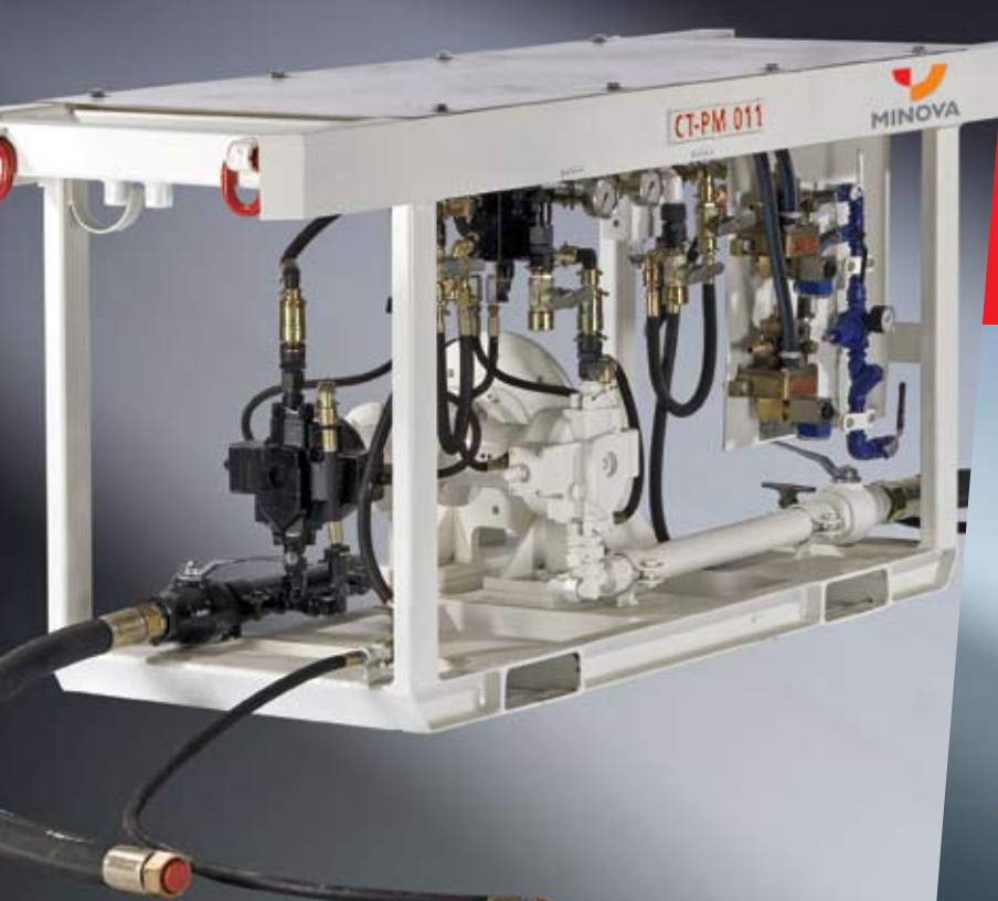
Pumps for application of CARBOTHIX: CT-PM pump (left) and PHP (below)